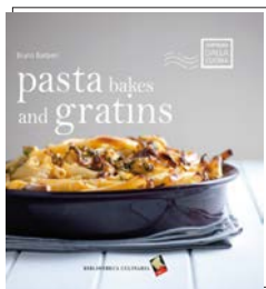
Pasta bakes and gratins