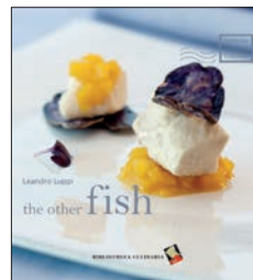
The other fish