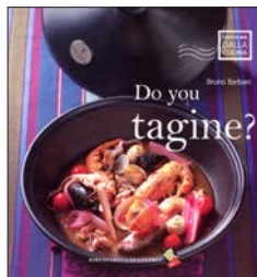
Do you tagine?